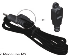
IR Receiver RX