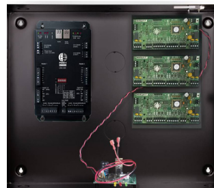
ENCL2-PS shown with door off