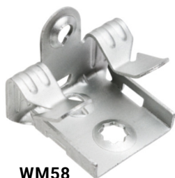
WM58 For 5/16" to 1/2" flange