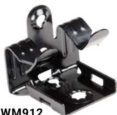
WM912 For 9/16" to 3/4" flange