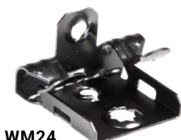
WM24 For 1/8" to 1/4" flange