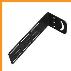
HRD-288-1 Universal Mounting Bracket