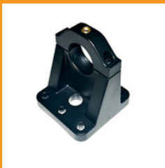
Ball & Socket Mounting Bracket