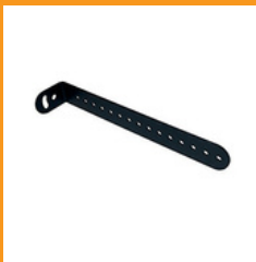
Reflector Extension Bracket