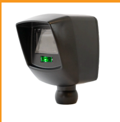
Integrated Sensor Hood